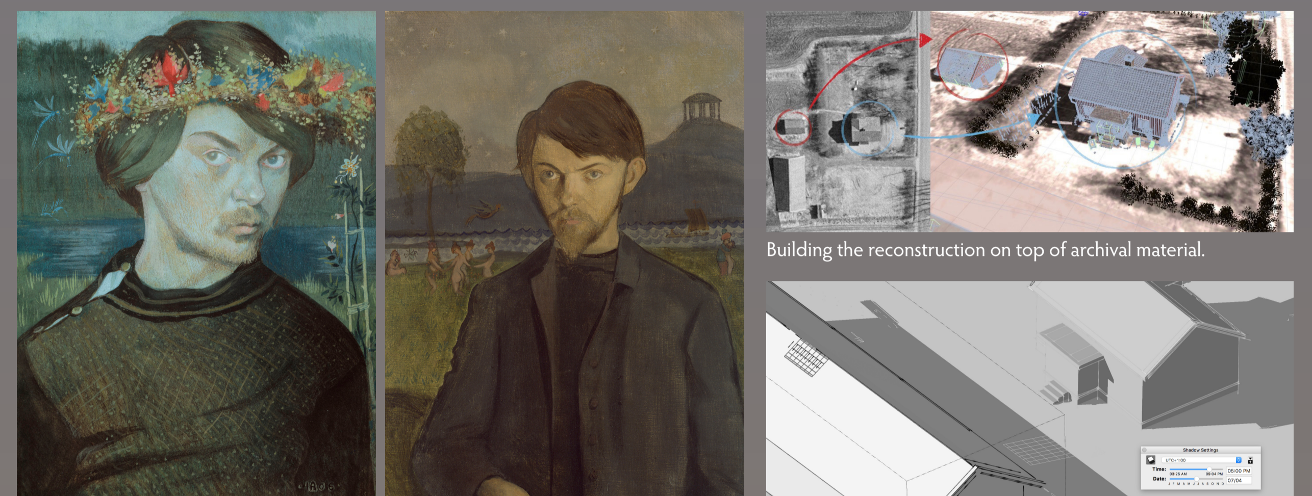
Self portraits by Ivar Arosenius, and the mythologized landscape of Älvängen.

With this interactive reconstruction we aim to construct a synthesis of a heterogeneous and sometimes conflicting material that can be used both as an access-point to the life of Ivar Arosenius and his art, and as a repository: built on a source material consisting of archival photos, local stories and historic maps, paintings, 3d-scanned artefacts, sound recordings, and inventories of both the belongings of the artist and his family, and of the vegetation on his lands, the digital construction is a knowledge-model containing all the material pertaining to this part of the artist's life. As such, of central interest for the study is how to communicate interpretative practices to the user, balancing an incomplete source material with the need to create a space that can inspire affect.