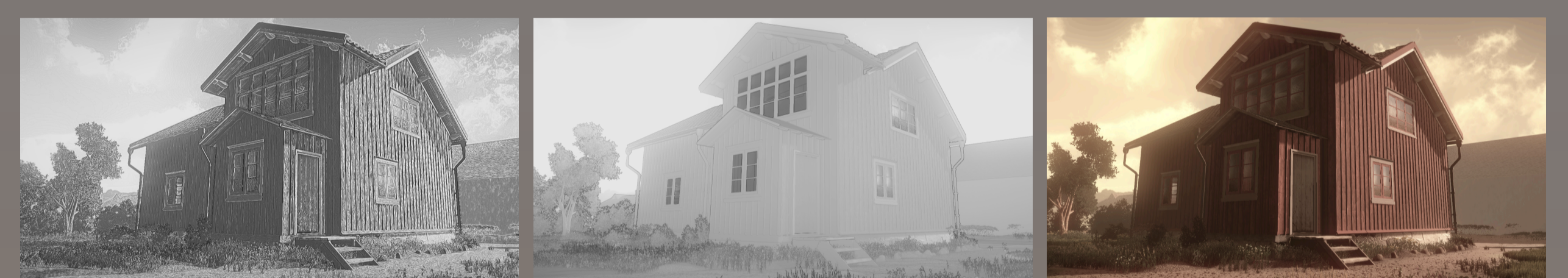
Experimentation with various graphical styles through which to reconstruct the home and garden of Ivar Arosenius. The incomplete, and insecure, source material is reflected in the reconstruction through various markers, but to create a space that can inspire affect these markers also need to be subtle.

Just as the archive contains a translation of Arosenius' home, first into documents and files, and later, when digitized, into bits, the reconstruction of Arosenius' home is a translation of bits into context. It is an investigation into both the limits of the archive view, that which the archive lets us perceive, and the product of activating and giving depth to the archive by bringing it together with the site of its origin. In the study, we frame the act of digitally reconstructing a site as an iterative research method of investigation and translation between different media, that allows a disparate material to be collected, studied, and processed simultaneously. Arosenius' Älvängen is at the centre of this study as it is the locus of the art, and also the place of the life that the archive tries to represent. As such, it is the archaeo-archival embodiment of the artist's archive.